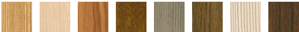
Oak 8920 Maple 8921 Cherry 8922 Cypress 8925 Grey Cedar 8931 Teak 8923 Whitewash 8924 Walnut 8927

Pre-painted coil with a PVC film finish, for interior only.